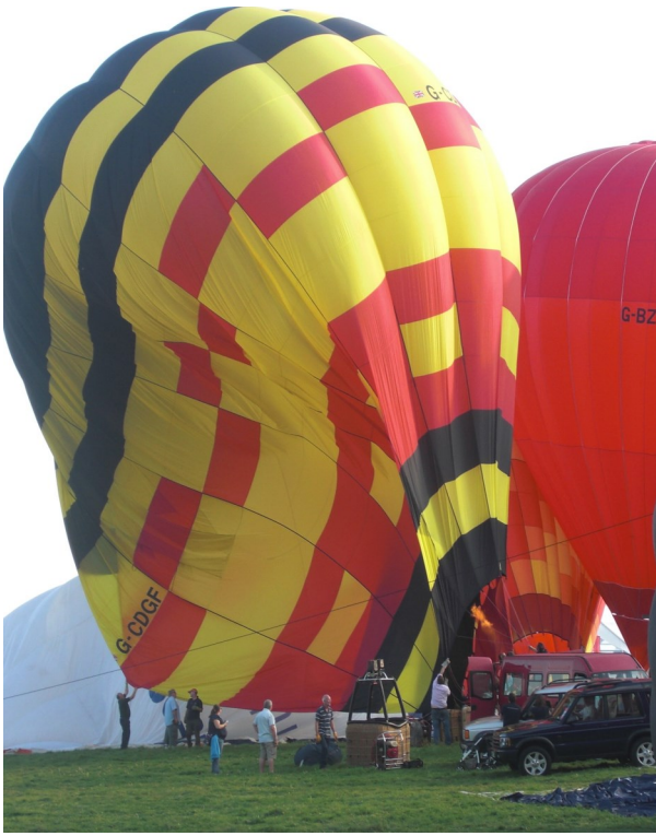
Inflating one of the balloons in the early morning.

Ahh ... the evening glow, another of those Fiesta moments, which bring the crowds in their thousands. This time the balloons remain on the ground but as it grows dark their burners flash on and off illuminating their bright colours. Music is then added to the mix and in time to the beat they pulsate like giant candles.