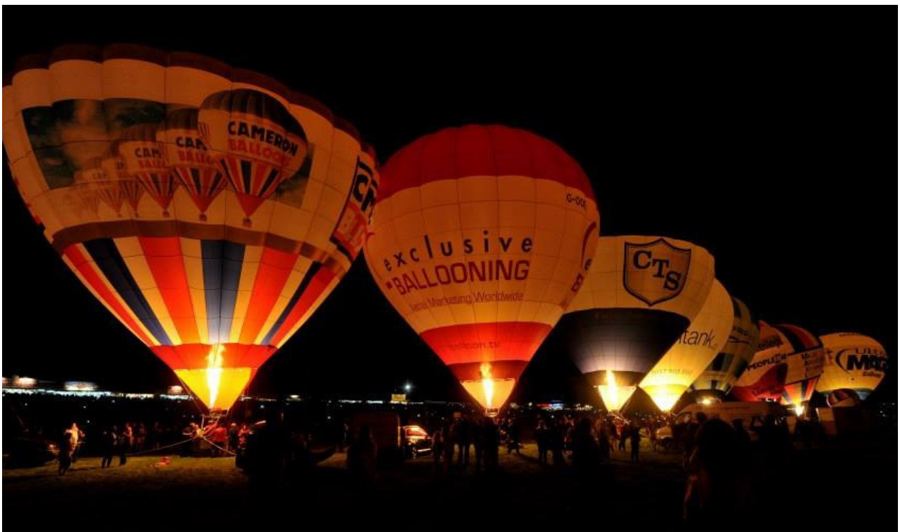
The evening glow

The performance lasts a good half hour and the crowds become more vocal as they join in as the music becomes more patriotic. Then to top it all the sky above is filled with exploding fireworks. Over the years the popularity of the night glow means that the four day event now has two evenings set aside for the spectacular and with mass ascents at 6 am and 6 pm even the English weather cannot rule all of them out and the Bristol skyline becomes a place of magical proportions.