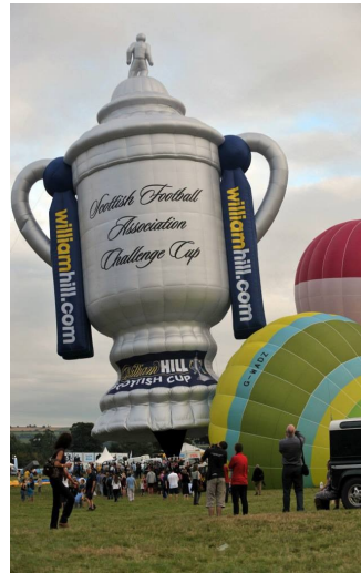
The Scottish Trophy

Ahh ... the evening glow, another of those Fiesta moments, which bring the crowds in their thousands. This time the balloons remain on the ground but as it grows dark their burners flash on and off illuminating their bright colours. Music is then added to the mix and in time to the beat they pulsate like giant candles.