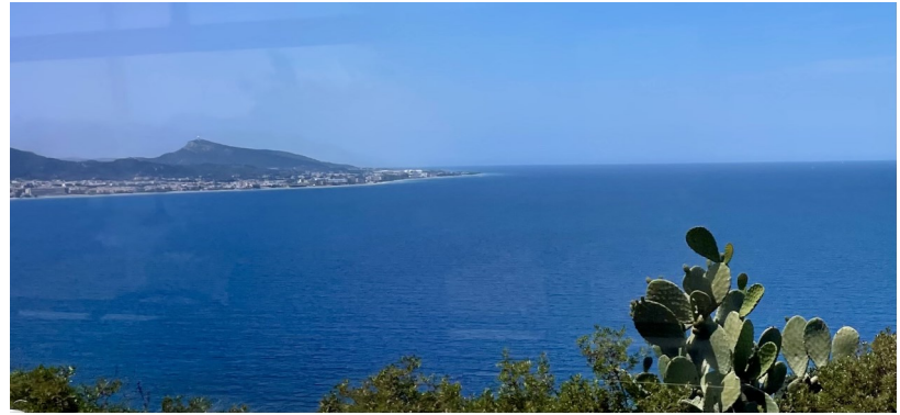
VIEW TOWARDS TURKEY