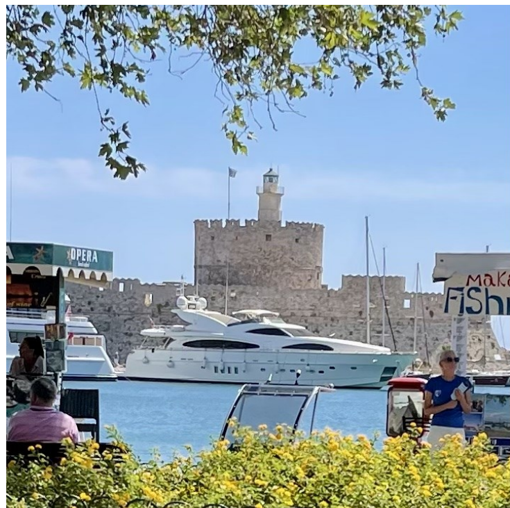
VIEW S AROUND THE HARBOUR