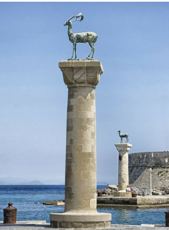
LOCATION IN THE MEDITERRANEAN